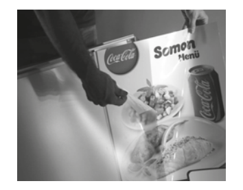
Insert your graphic, place the PVC protective cover on top and close the snap frame profiles