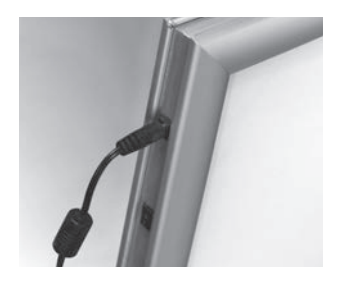
Connect power supply to LED Slimframe