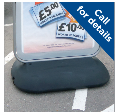
Lower cost, lighter weight base option available for 30" x 40" and A0 sizes. Volume/contract enquiries only.