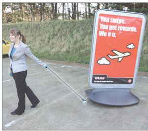
Purpose-designed trolley available separately (see page 38 for details)