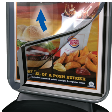
Magnetic poster covers for quick and easy poster change