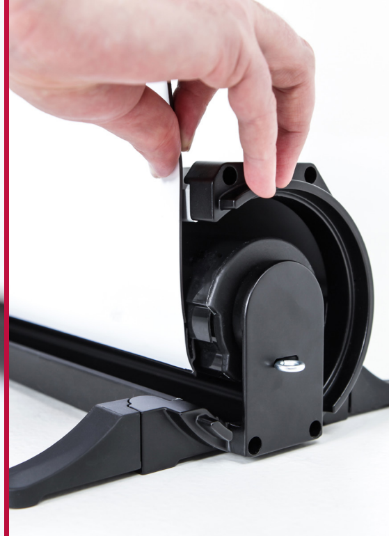
1. To stop a graphic from retracting insert a locking pin into the base of the Link<sup>2</sup>.