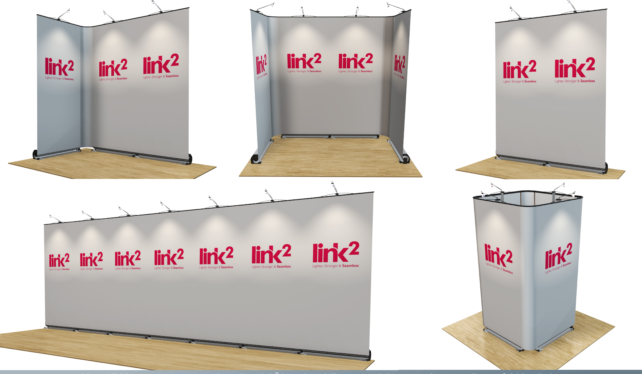
With exhibition space at a premium the Link<sup>2</sup> has the ability to go right up against a wall. Just fold back the rear stabilising feet and push back up against a wall.

BUILD SMALL TO MEDIUM EXHIBITION STANDS USING LINK<sup>2</sup>