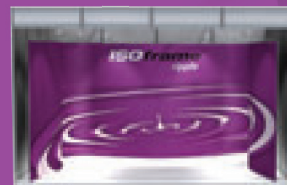
4m x 2m