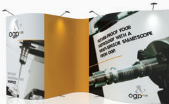
A seven panel Ripple kit