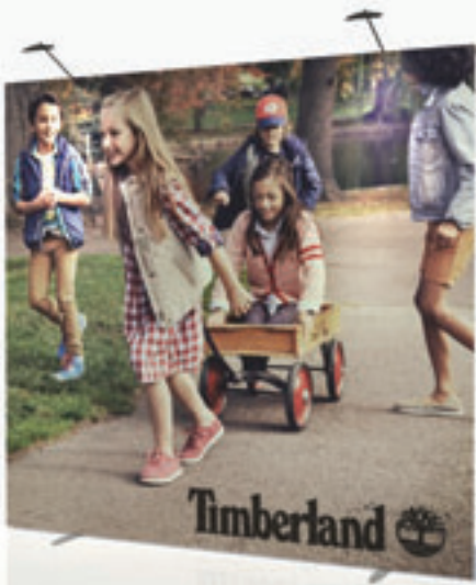
A three panel Ripple kit with flexible centre panel