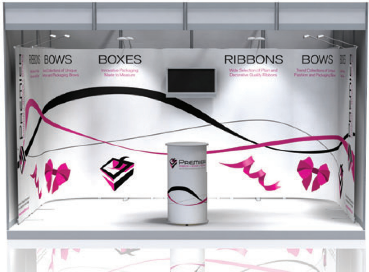
Ripple kits are ideal for small shell scheme spaces using close-to-wall base supports