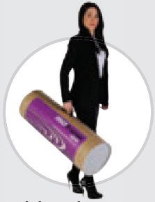
Lightweight and easy to carry