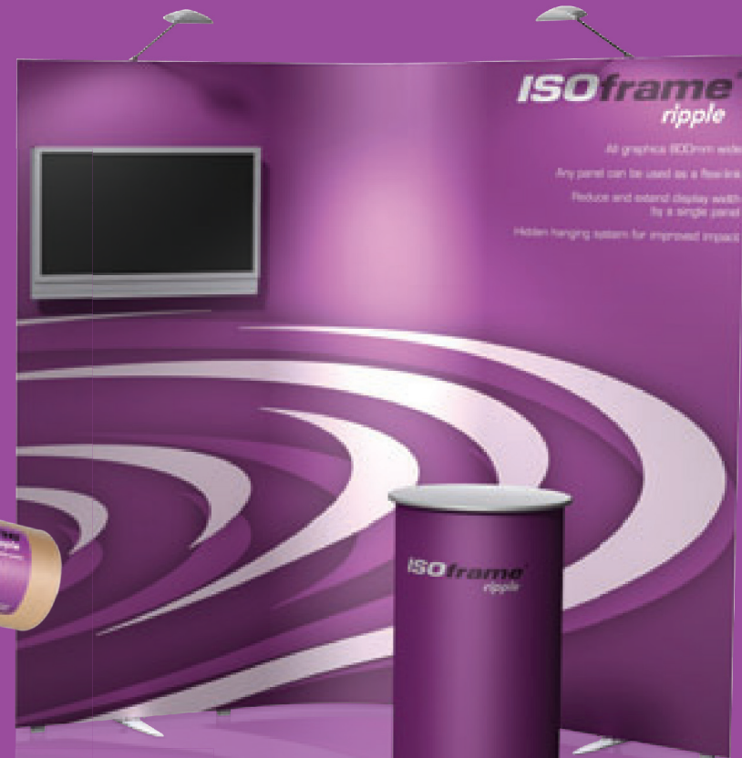
Three Panel Kit