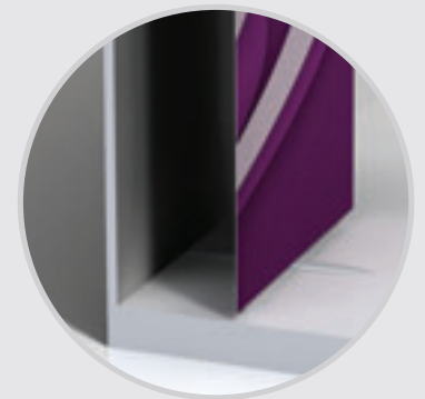
Close-to-Wall Base Support