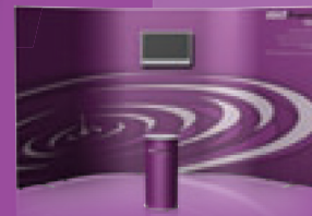
Five Panel Kit