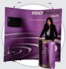
Attach graphic to complete the counter