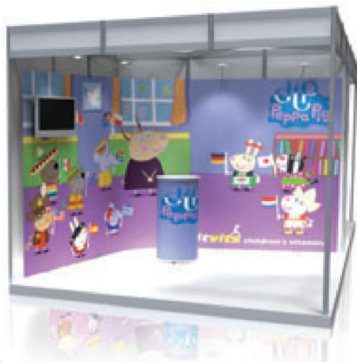
Ripple kits can flex to fit any event space. Pictured with close-to-wall base supports