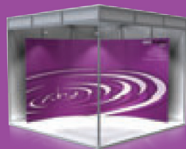
3m x 3m