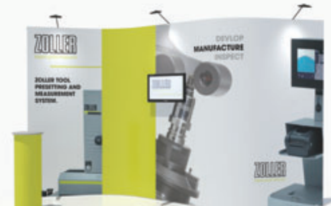
A five panel Ripple kit case-to-counter and small screen