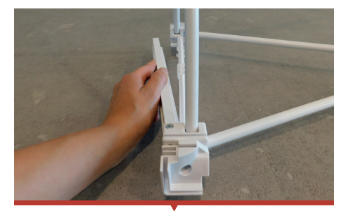
6. Close the attached bars in the corners.