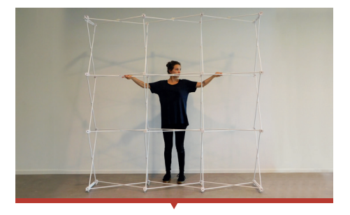
4. Gently lift up the frame while flipping it over, the pop-up frame will unfold itself.