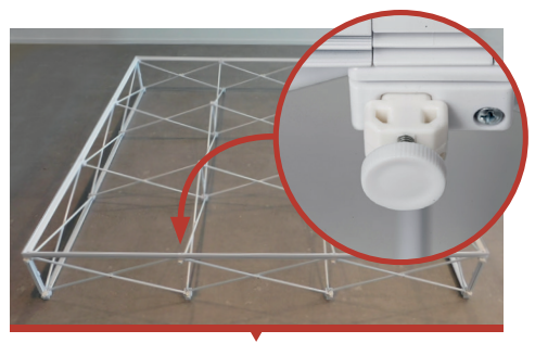
8. Place the frame on the ground, the adjustable feet mark the bottom side of the frame.