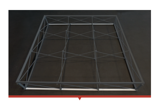
13. Optional: for double-sided use, add the extra bars on the top and bottom of the backside.