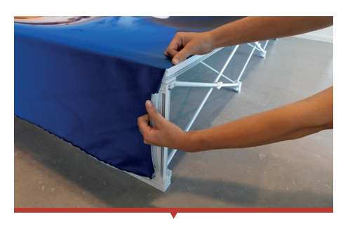
10. Start in the corners of the frame, to divide the tension.