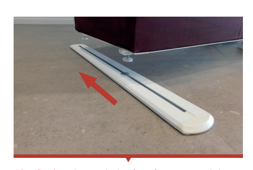
14. Optional: attach the feet for more stability, by sliding them over the 2 adjustable feet.