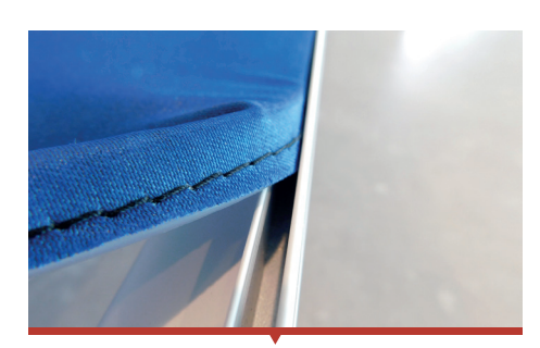
9. Attach the fabric by pushing the silicone edges in de grooves.