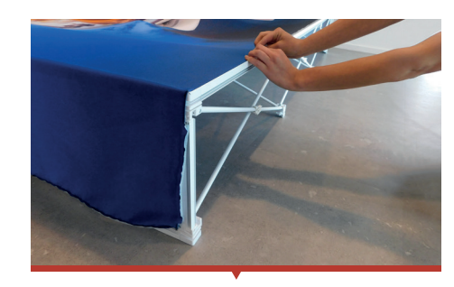
11. Work your way around the frame until all silicone edges are attached.