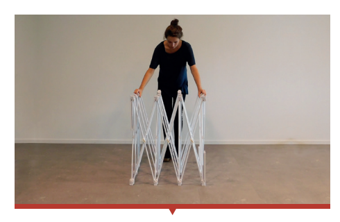
2. Open the frame slightly by pulling the hinges outwards.