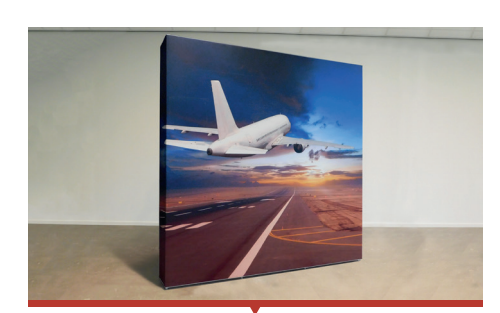
12. Lift the frame up again, the Pop Up Impress is now ready to use.