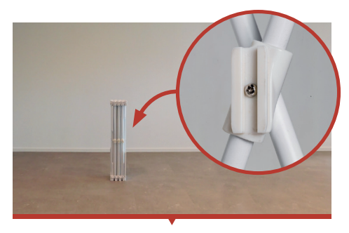
Place the frame in front of you with the light connectors facing away from you.