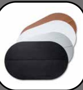
Choice of Table Tops