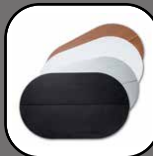
Choice of Table Tops