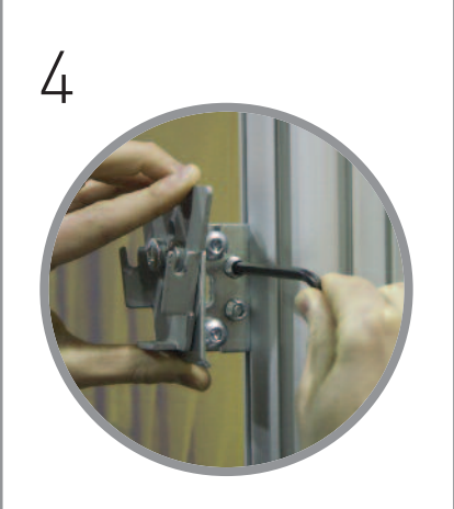
Adjust and tighten 4 screws at side of Interface bracket until securely clamped to post in desired position.