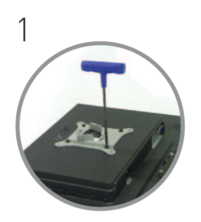
Align VESA mount to rear of monitor, insert 4 off fixing screws and tighten. Arrow on the back of the mount should point towards the top of the monitor.