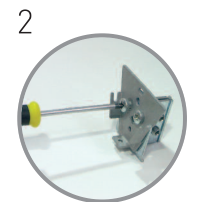
Screw VESA bracket to Interface bracket through two fixing holes (as pictured). Ensure arrow on VESA bracket points to narrow edge of Interface bracket.