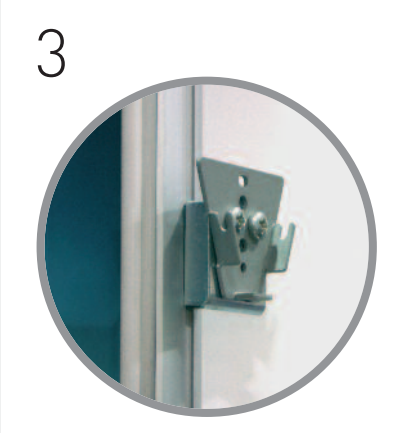
Locate assembled bracket clamp grooves into 8-way post.