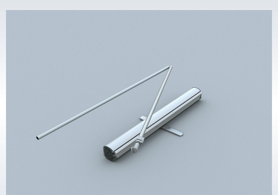
Unfold the 2-part supporting rod. Make sure that the parts click in each other. \,