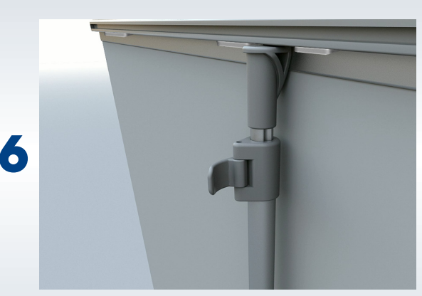
Loosen the lock lever on the telescopic rod.