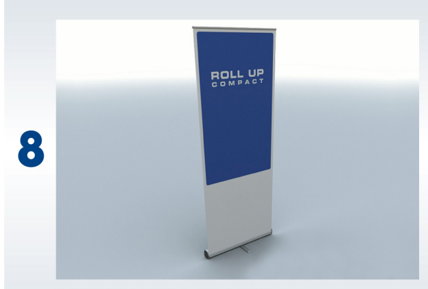
Verify that the system is even. READY!