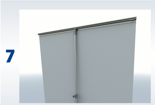
Chose desired height and seceure with the lock lever.