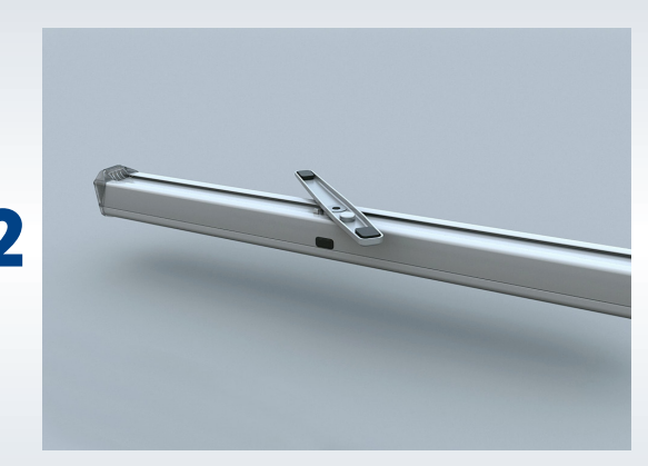
Unfold the stabilising foot and place the cassette on a flat surface.